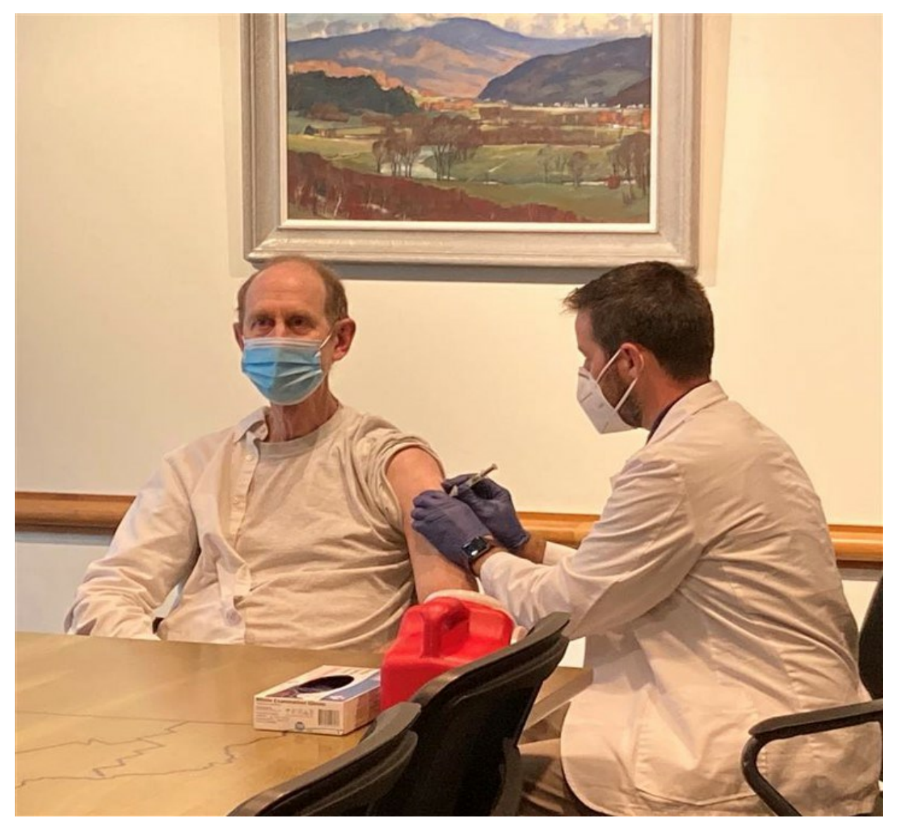
Department of Health Commissioner Levine gets his flu shot. Flu vaccinations are particularly important this year, as the combination of COVID-19 and the flu could strain the healthcare system and lead to as-yet-unknown health complications.